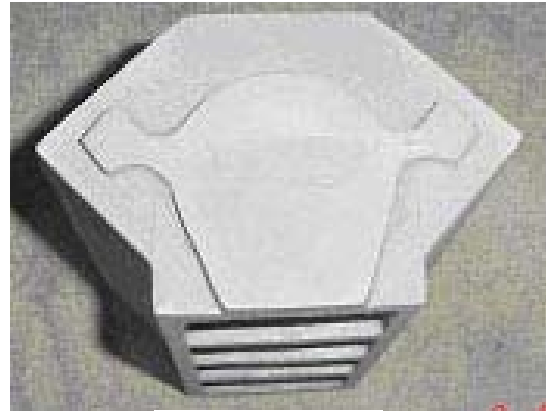
V8 Casting End

At the next meeting I will bring information on Polo shirts & hats with the club logo on it. Shirt are $23.00 & hats $16.50. I will ask for ideas on the logo design. I drove to Stockton on July 3 to see John Vlavianos @ DeVecchio Foundry. John just completed the patterns & core boxes and got 4- -- 5 main V-8 blocks poured out of alum. I picked up 4 engines for proofing out the castings. I hope to have something to show at the next meeting. Here are a couple views of the block un-machined. See you @ the next meeting.