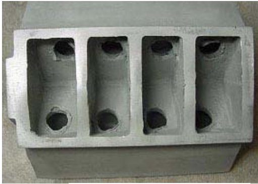
V8 Casting Bottom View