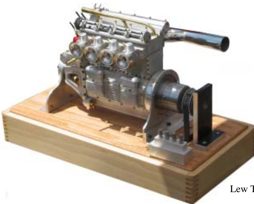
Lew Throop's Offenhauser