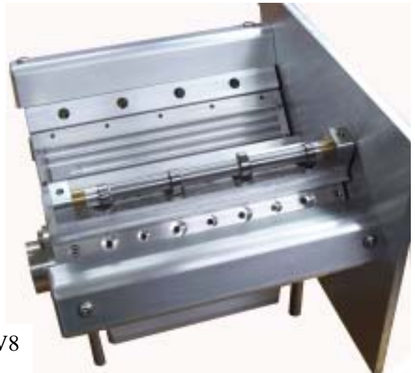
Dick Pretel's Challenger Overhead Cam V8