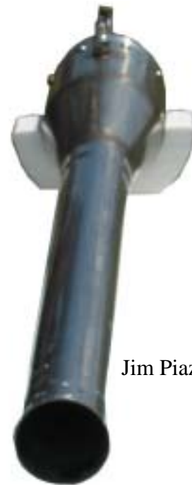
Jim Piazza's Pulse Jet