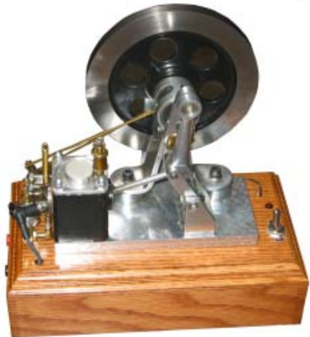
George Gravett's 6 cycle