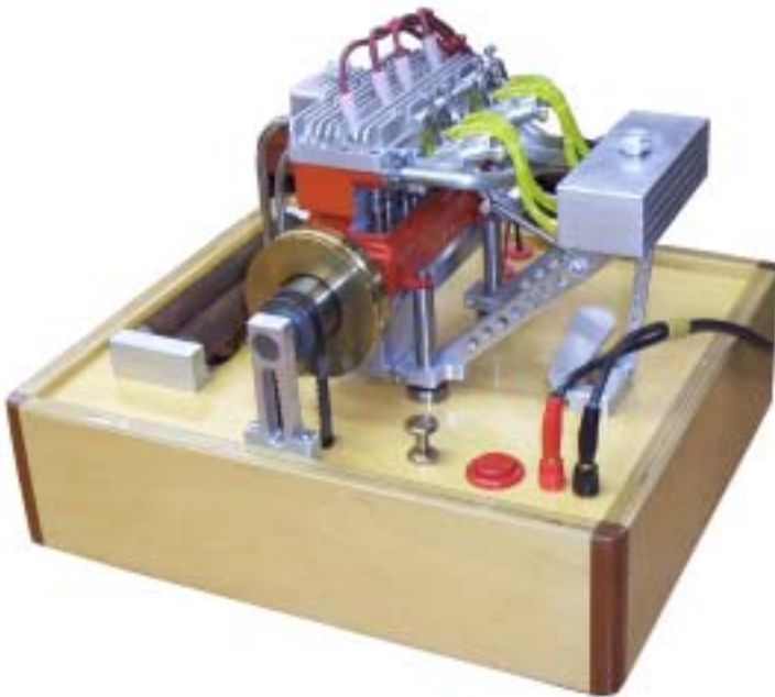
Dick Pretel's Wall 4

We are looking for solutions so be ready to add your twobits worth.