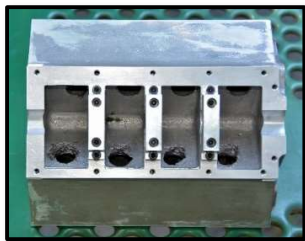
Steve Ridgway's Black Widow V-8, showing initial machining work on the block.

Steve Ridgway has started a Black Widow V-8 and brought the block. He also brought in a nice looking GEM 1 that looks to be about three fourths finished.