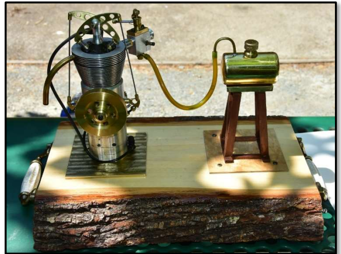
George Spain's "Jules Verne #2", mounted on a natural-edge log base.

George Spain brought an interesting single cylinder vertical of his own design. It's a single-cylinder, air cooled, four-stroke engine, featuring a single lobe cam for both intake and exhaust. He calls it "Jules Verne #2". It was mounted on nicely finished log slab and ran very well.