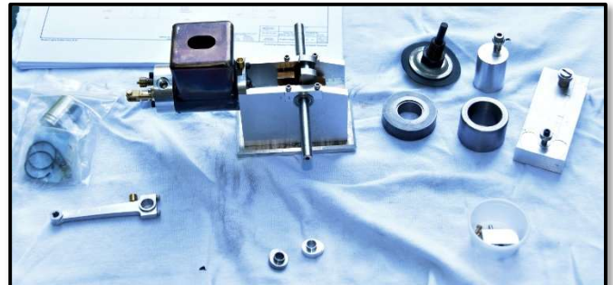
Larry's GEM 1 kit parts, showing initial work completed.

Larry Zubrick is also working on a GEM 1, using one of Dwight Giles' materials kits. Larry had several finished pieces as well as fixtures for cutting the connecting rod and polishing rings.