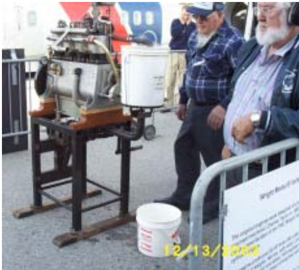
Wright Model B