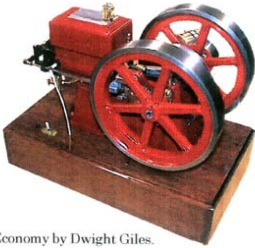
Economy by Dwight Giles.