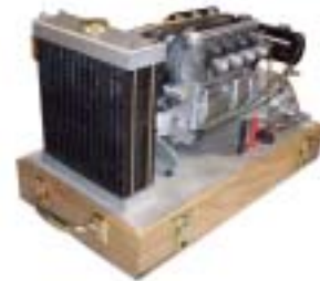
"Offy" 270 Built By Roger Butzen