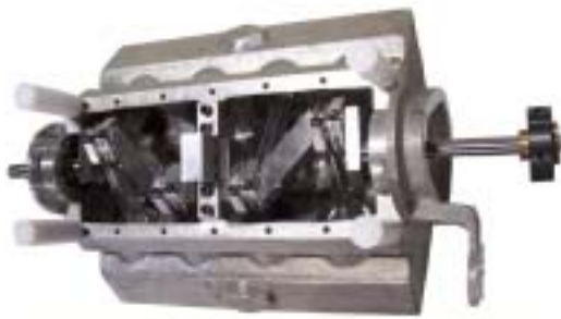
V8 Flat Head 1/4 scale by Steve Myers