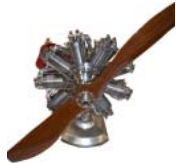
1918 Bentley BR-2 Rotary Engine 1/6 Scale Built by Louis Chenot