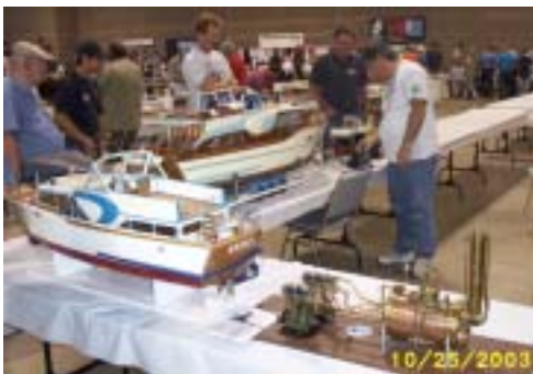
John Garis' remote controlled boat powered by a