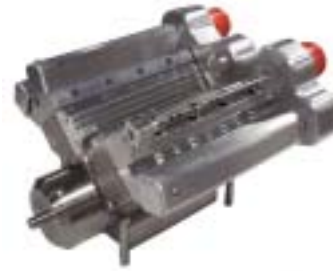
Challenger Overhead Cam V8 Built by Dick Pretel