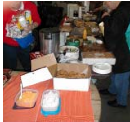
Table of Good and Plenty