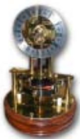
Clock Lew Throop