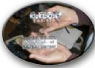
Offy 270 1/4 scale