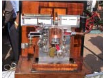
Bob Kradjian's Internal Combustion Engine 4 Cycle Demo

NEXT MEETING 14 Dec, 2002 AT 10 AM AT Robert Schutz's Shop 366 40th St. Oakland, CA