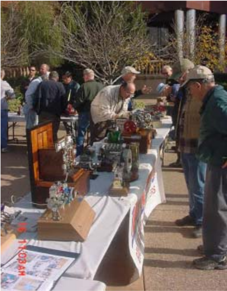
Our BAEM club had a large turnout at Blackhawk