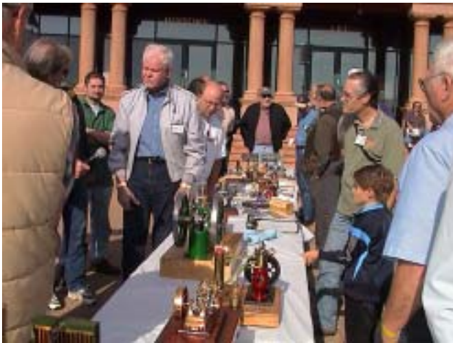
Carmin Adams Fairbanks Morse Engine