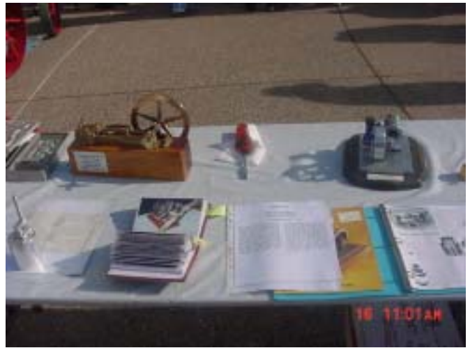
Bill Nickels' Steam drilling and Fire Eater hot air engines.