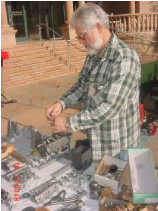
Eugene Corl's Chevy V-8 1/3 scale